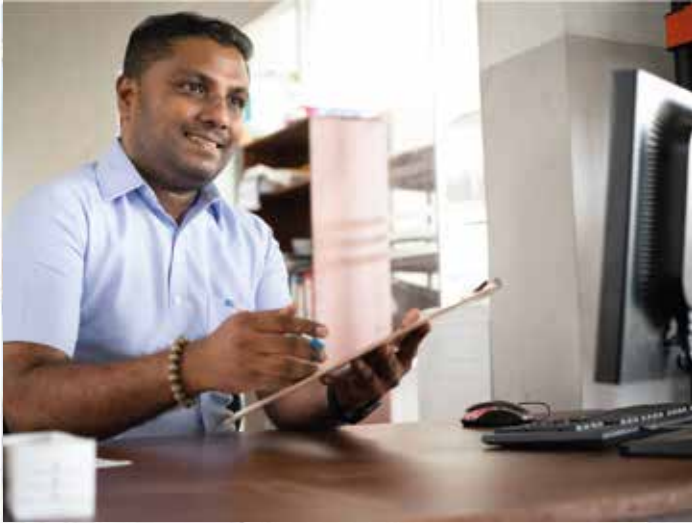
Professional & friendly staff always ready to help customers