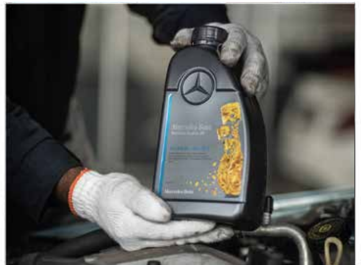
The best genuine products for your Benz