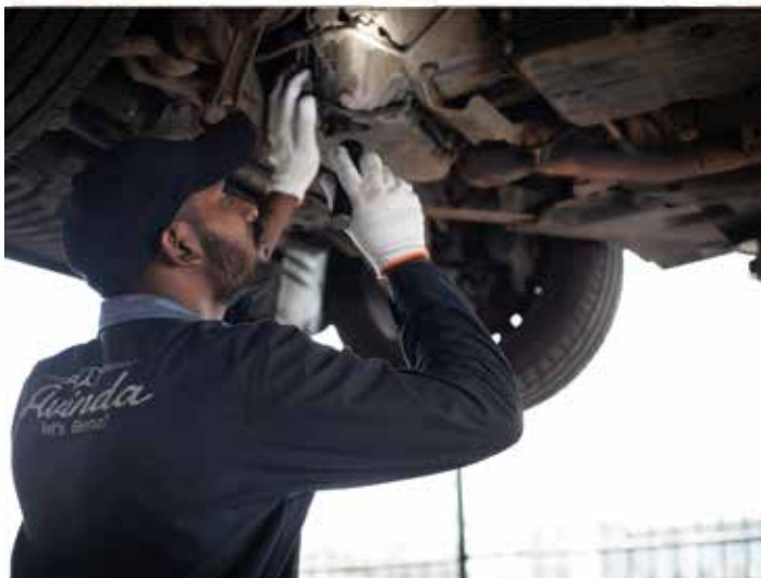
Well trained staff to perform accurate inspections