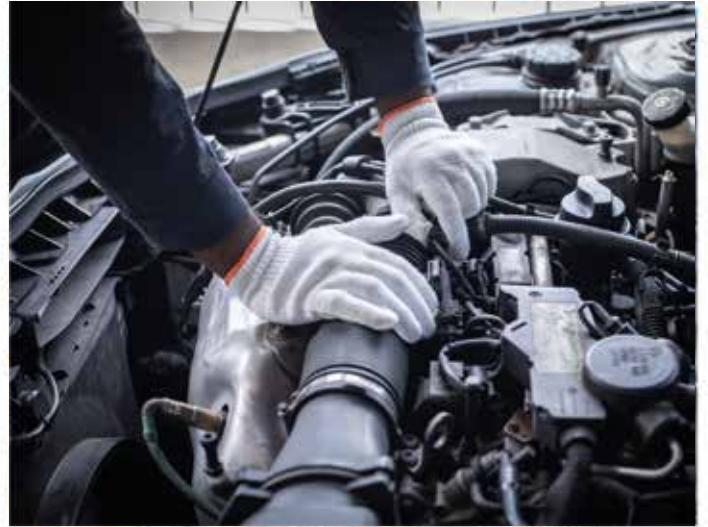
Careful disassembly of sensitive components