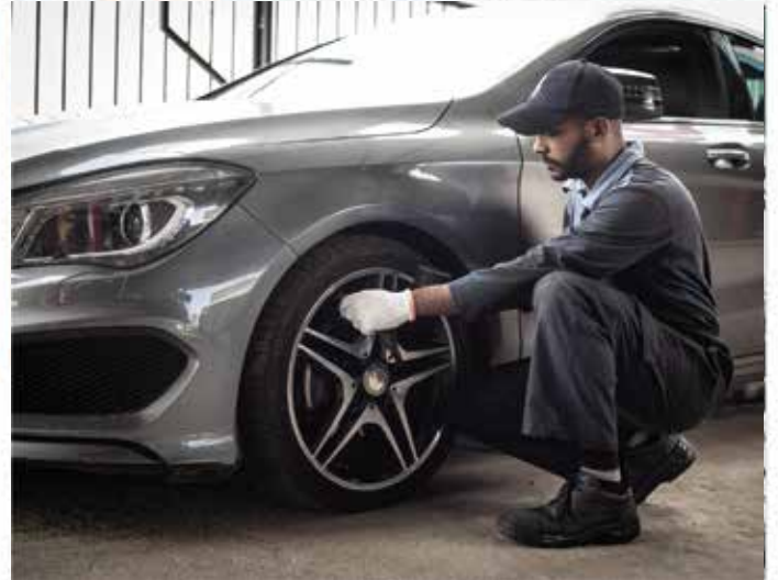
Even the smallest check up such as tire pressure is a vital check up!