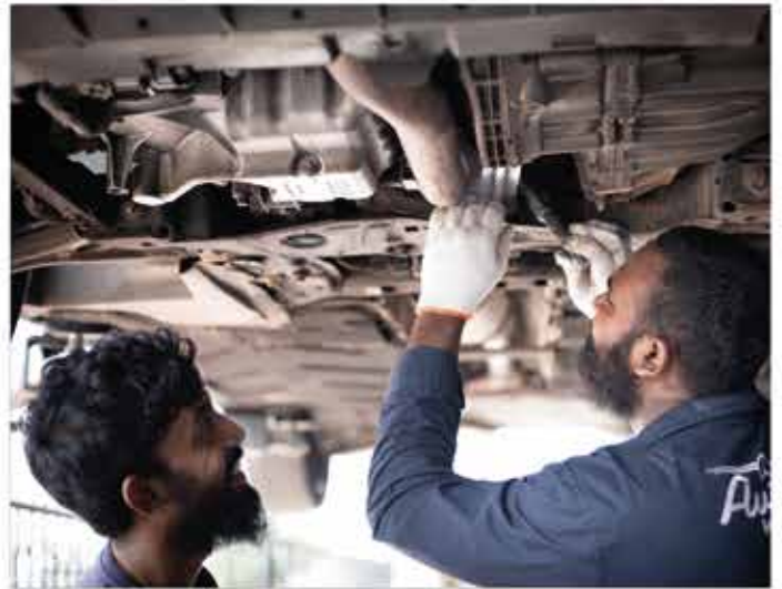
Passionate technicians working on Mercedes-Benz vehicles.