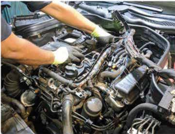
Wiring harness repair being carried out on a W212 E250 CDI