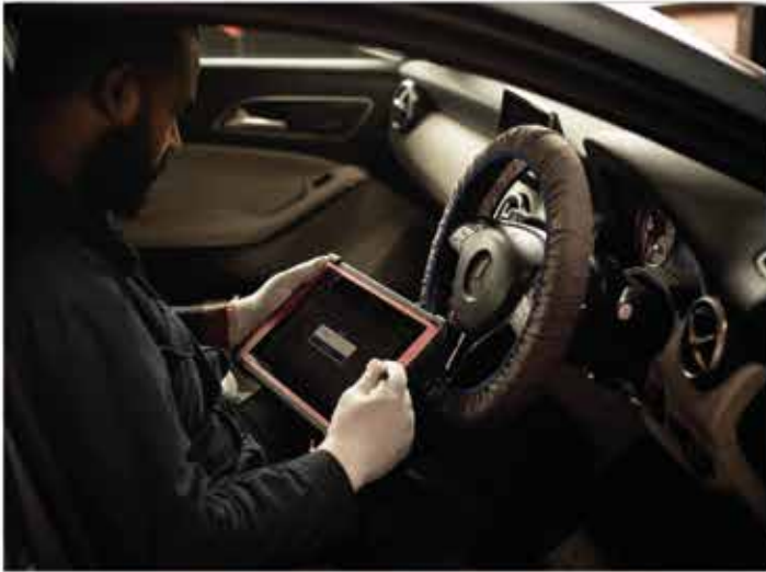
Diagnostics are performed on dealer level equipment.