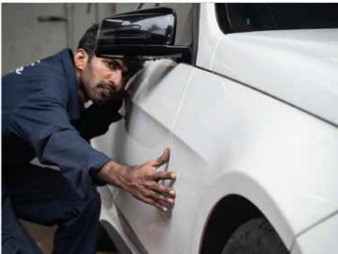
Precision is key!