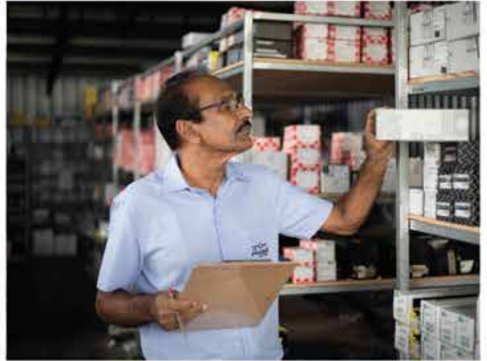
Large warehouse with advanced inventory management